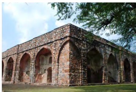
Mirza Muzaffar Hussain's Tomb Before conservation in 2010