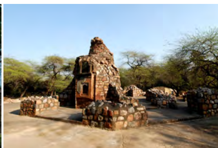
Chota Batashewala Before conservation in 2010