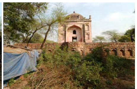
Mughal Tomb Before conservation in 2010