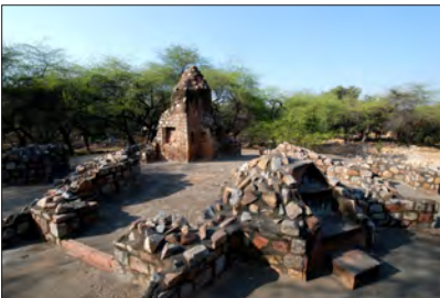
Chota Batashewala Mahal ►