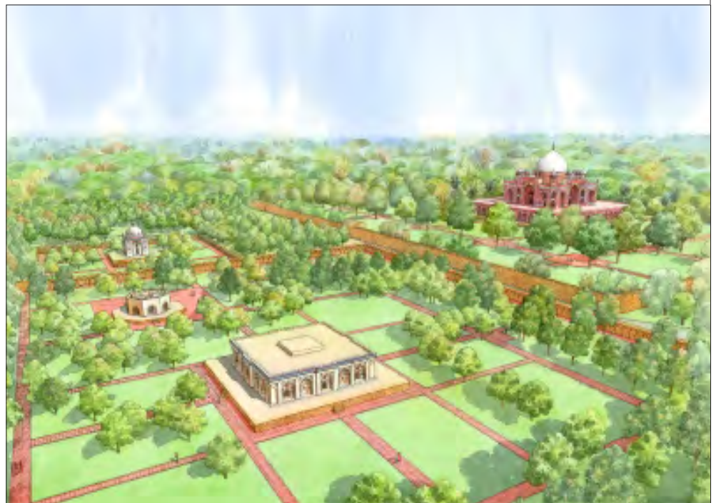
Humayun's Tomb ▼