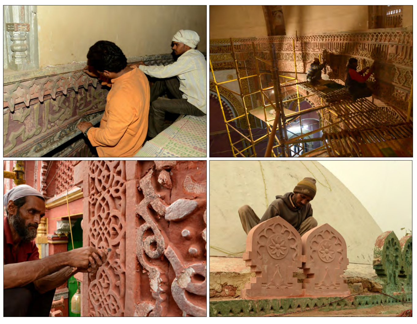
Conservation works at the 14<sup>th</sup> century Khilji mosque required scrapping of several dozen paint and cement layers prior to repair or replacement of the damaged sandstone elements.