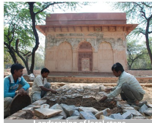
Landscaping of local stone