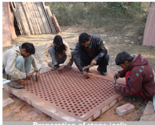
Preparation of stone jaalis