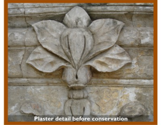
Plaster detail before conservation