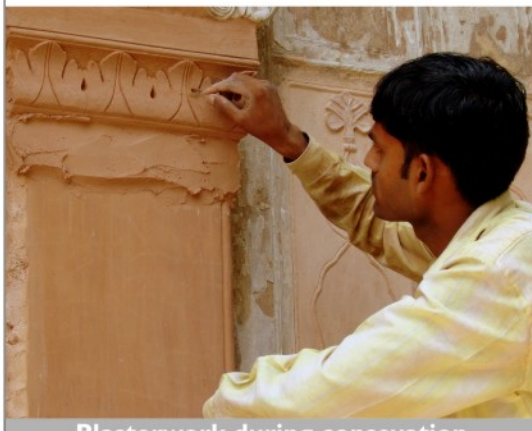
Plasterwork during conservation