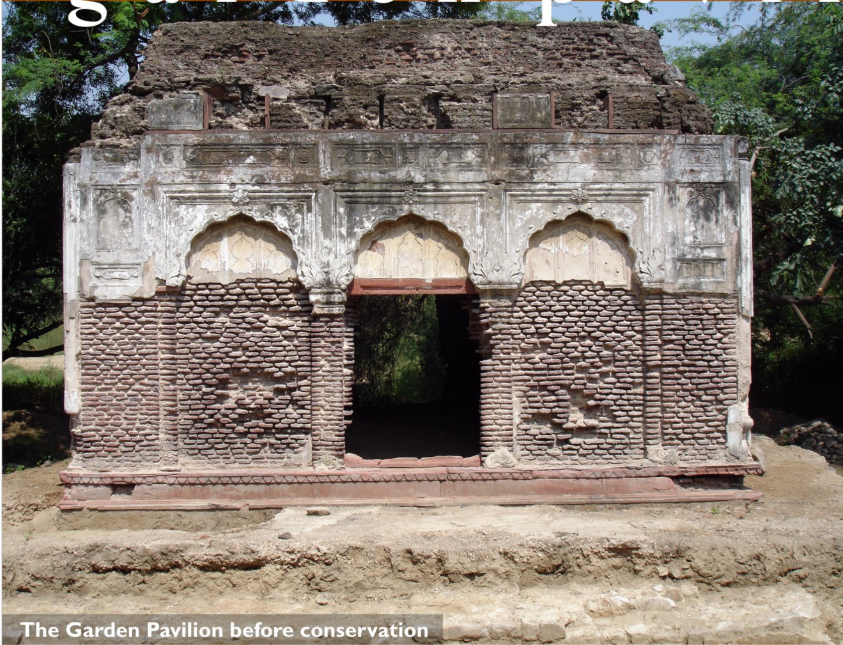
The Garden Pavilion before conservation