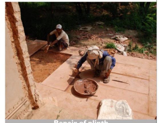
Repair of plinth

When the AKTC began work at Sunder Nursery, the Garden Pavilion was found in ruinous condition, threatened with demolition by the proposed construction of an extension of National Highway 24 through Sunder Nursery to Lodhi Road. Conservation works aimed at enhancing the cultural significance, ensuring structural stability and integrity of this unique building in Delhi.