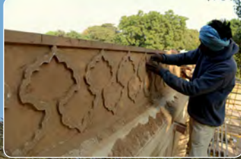
Terrace & Facade