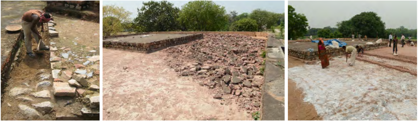
(Left) Dismantling existing cement concrete from flooring; and (Middle) terrace and (Right) laying lime concrete. The final phase of conservation works at Sundarwala Mahal are supported by HUDCO through NCF