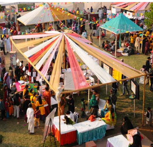
Detailed documentation of the monuments, historic buildings and graves with the urban setting (Top) Installing computer kiosks 'hole-in-the-wall' in key locations where they can be accessed by a large section of children (Bottom) Apni Basti Mela in the Basti attracts both basti residents and visitors from across the city