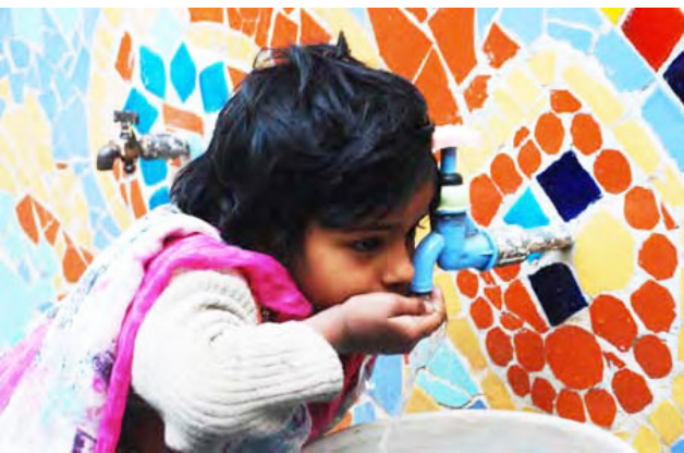
(Top) Youth from the Basti learn the age-old craft of hand-made tiles used on the Humayun's Tomb and other monuments in the area (Centre & Bottom) Upgrading of streets and other urban infrastructures like restoring water points and roundabouts and providing better services not only enhance visitor experience but also provide cleaner environment for the residents