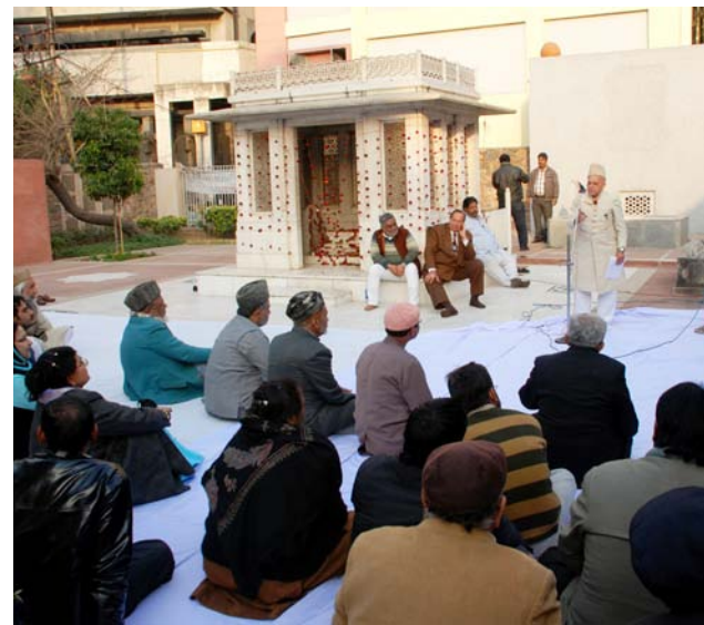
(Top) Women's self-help groups from the Basti producing and marketing products inspired from motifs and designs of the built-heritage of Nizamuddin; Creating performance venues for traditional music and poetry recitals in the forecourt of Chausath Khamba (Centre) and courtyard of Mazar E Ghalib (Bottom)