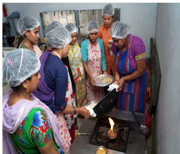
Figure 7: Work in progress by ZeN

In addition after taking prior permission from the CDPO, distribution of these healthy snacks items was started both in the anganwadis and in the basti.