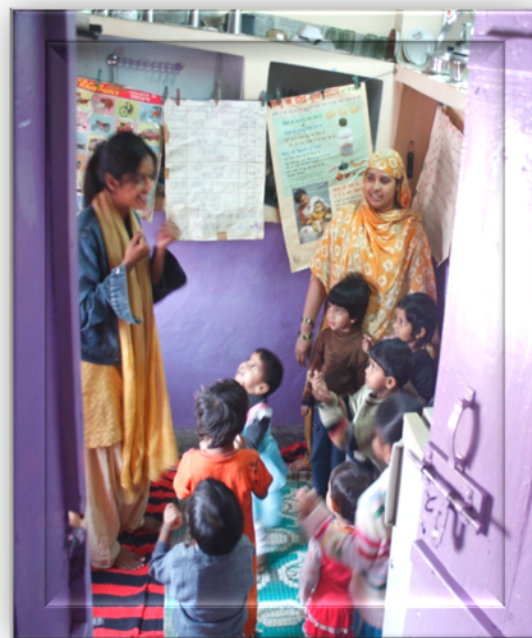
Figure 1: Pre-school activity by Community teacher

The anganwadi centres lack the appropriate space for preschool activities which is a concern across urban centres. The community teachers are specifically oriented towards modifying the activities to be conducted in the given space till the time proper space is made available through increased rents for the anganwadi centres (despite the revision of norms for rent).