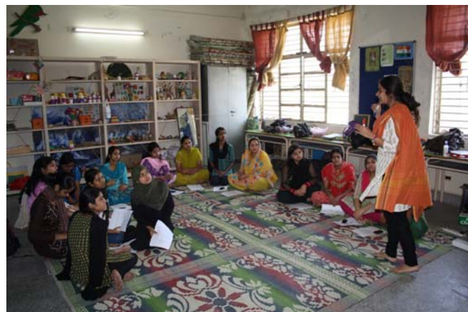
Figure 3: Teacher’s Training on pre-school education

Capacity building is a very crucial aspect of AKF’s preschool education programme. It makes the teachers well equipped to work sensitively with children and to be able to achieve the learning outcomes. In this reporting period, 90 days’ capacity building of the community teachers was done on topics like psycho-social development amongst children, arts based therapy and strengthening pedagogy through better classroom management and curriculum transaction. Also an essential aspect of these training sessions is to create linkages between learning at pre school and primary level focussing on teaching language and maths specifically.