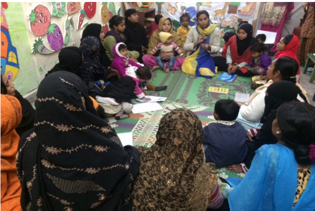
Figure 10: Discussion with mothers on early stimulation

Summer camp was organised for 15 days in three years' consecutively with over 220 children. It is an opportunity for children of learning with fun through varied experiences of activities in arts, music and theatre. For many children its a first step towards pre-school after which they get enrolled in the anganwadis or MCH. Also its a good opportunity for parents to see and understand what ECCD is all about when they come to drop or pick up their children.