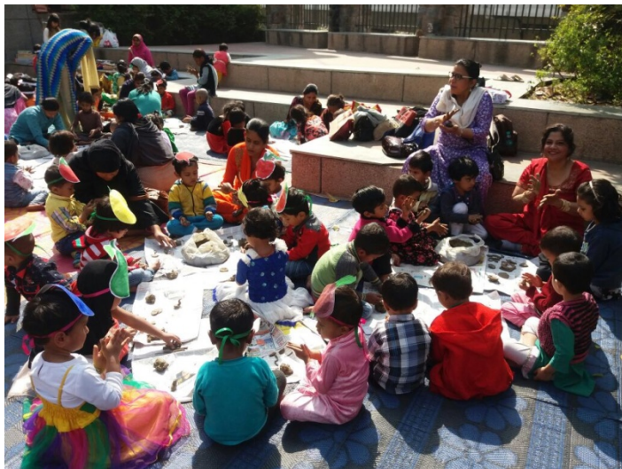
Figure 8: ECCD Day celebration on 19 th April, 2017

AKF Community teachers have been organising ECCD Days on a monthly basis with the support of Anganwadi workers and helpers. These melas are an important forum for the community to understand the role of aanganwadis in early childhood care and development and the importance of sending their children regularly to the aanganwadis. They also help to build a better relationship with the community