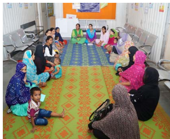
Figure 9: Parenting Programme meeting

The parenting programme emerged from the observation that young mothers particularly first time mothers living in nuclear need help to understand issues related to maternal and child health as well as development of children. There are 11 sessions under the programme focussing on understanding menstruation, pregnancy, pre natal and postnatal care, breastfeeding and nutrition of children, immunization and developmental milestones of children. The sessions are structured and activity based so that field workers can conduct them with some supervision and hand holding, engaging women