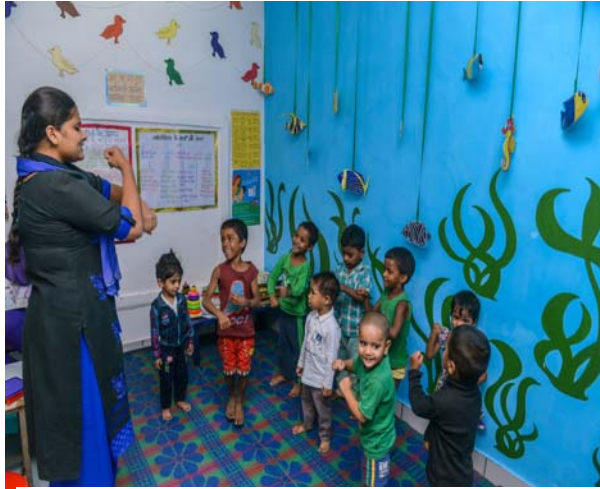
Figure 4: AWC No 17 after revamping

AKF has consistently been providing support in terms of resources and infrastructure