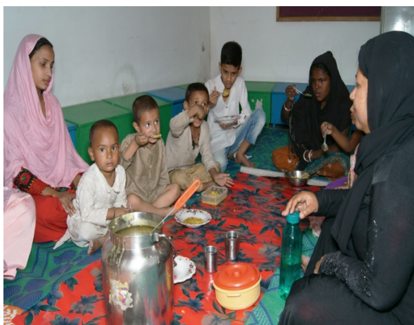
Figure 6: Feeding of children under programme

Regular growth monitoring was initiated by the AKF Community Health Team in 2012, after unsuccessfully trying to regularise it at the aanganwadi level; data pointed to there being atleast 35-40 young children to be severely malnourished. With the situation not changing over a couple of years of our growth monitoring intervention and there being no corroboration with the government records, we initiated a supplementary nutrition programme in May