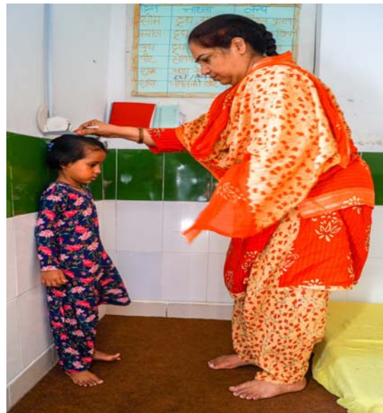
Figure 5: Growth monitoring by Community Health Worker