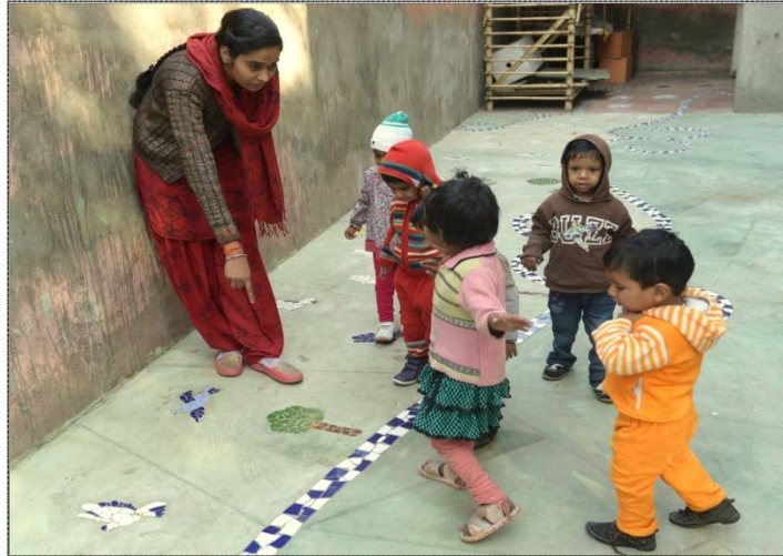
Floor as a medium for Play

encourages language development, story telling, seriation, numbers, imagination to name some. In addition, instead of being an unsafe and unattractive space, it has become a point of attraction.