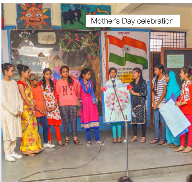
Mother's Day celebration