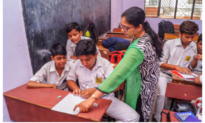
An Access class in progress

And let’s not forget a mention about The YES (Youth Exchange and Study) Program in which eligible