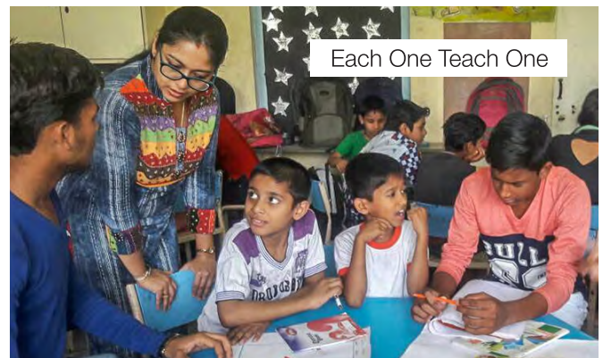
Each One Teach One

Malala Day was celebrated on July 12, 2017 where students made colourful posters made in groups. The posters spoke of Malala's birthday and her contribution to Women Education Rights. They also read about Malala's life before after the Nobel Prize.