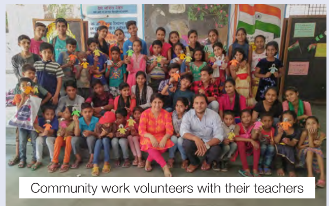
Community work volunteers with their teachers