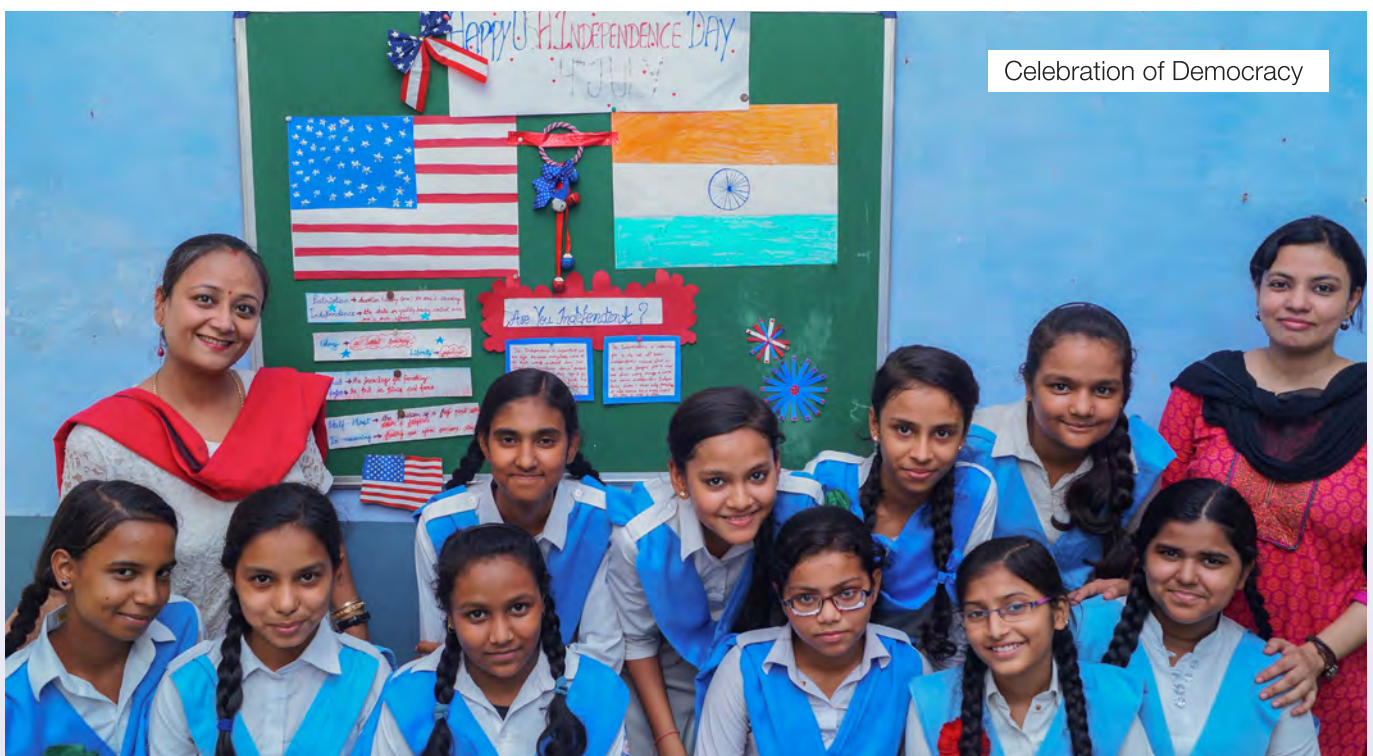
Celebration of Democracy