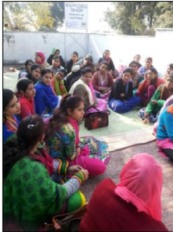
Picture 8: Members of Insha-e-Noor interacting with members of KGU during their exposure visit to CHIRAG