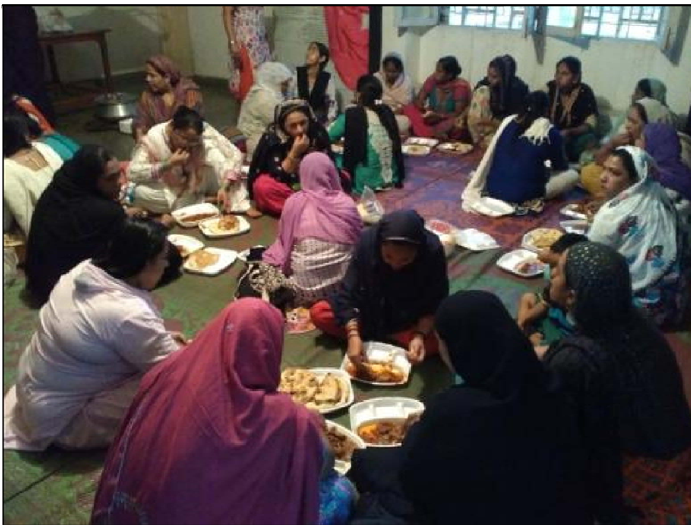
Picture 3: Members having lunch during a training session