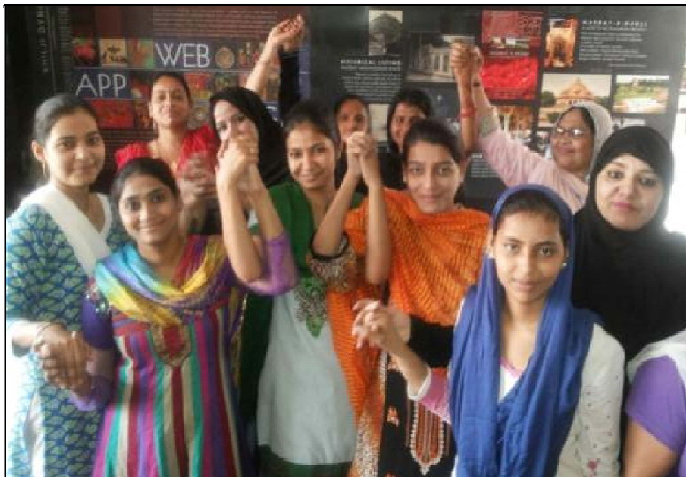
Picture 9: Members of Insha-e-Noor involved in an activity during a Life Skills training session.